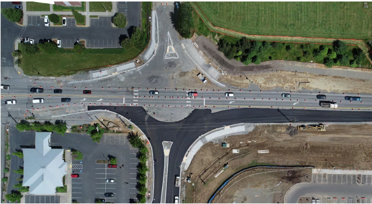
Roundabout currently under construction (above photo). Below photo is roundabout at 204 th St. (example).